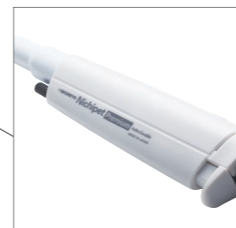
Materials used for pipette body have high tolerance to solvents and drop impact.