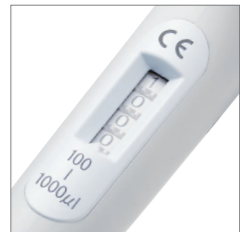
Enlarged and easy to read counter display for volume setting.