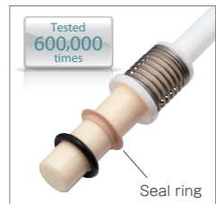
Seal ring for the Premium is tested dispensing / aspirating 600,000 times. Non-greased plunger makes it easy to maintain. ( 2μL - 1000μL ) The test was conducted by Nichiryo. The test result may vary with condition of usage.