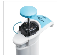
New material used for 4 notch-lock improves its strength, which minimizes the lever shift from the original position.