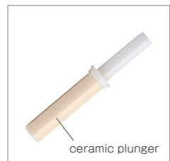
Non corrosive ceramic used in the plunger. ( 100μL - 10000μL )